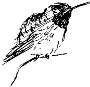
Hummingbird perched Artist Kirsten Munson

We will bird a loop trail along the beach past the Snowy Plover reserve, by the pond below the storage tanks, around the top and east side of the slough, and back to the cars.