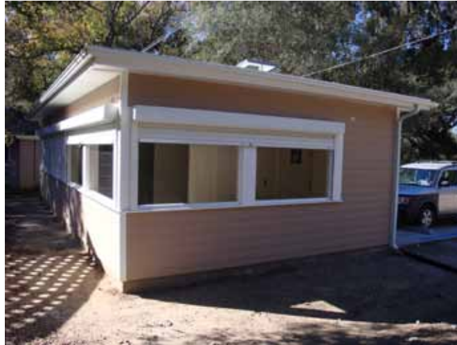
The new aviary.

After a seven year process, we have now moved into our new aviary at the Santa Barbara Museum of Natural History. Thank you all for your generosity, especially during these hard financial times. I hope that, as our partner in this venture, you will feel pride in our joint accomplishment. Thanks to you, we also raised the $1,500 for a guard rail that keeps busy fingers and pressing faces away from the aviary netting. Construction will most likely be completed by the time you read this.