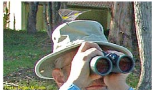
This Audubon Warbler finds a way to evade the Christmas Bird Count!

For more information on this program please contact the office or go to the Audubon website: http://www.SantaBarbaraAudubon.org/sbasprograms.html