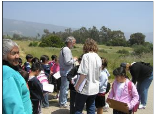
Field trip at Lake Los Carneros