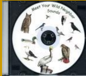
Bird Sound CD

Pre- and Post Tests: Students draw lines from bird pictures to bird name, and from sound number to bird picture.