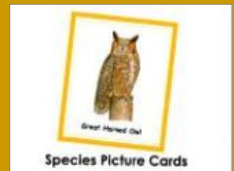
Species Picture Cards

4 Envelopes containing 32 different Cards