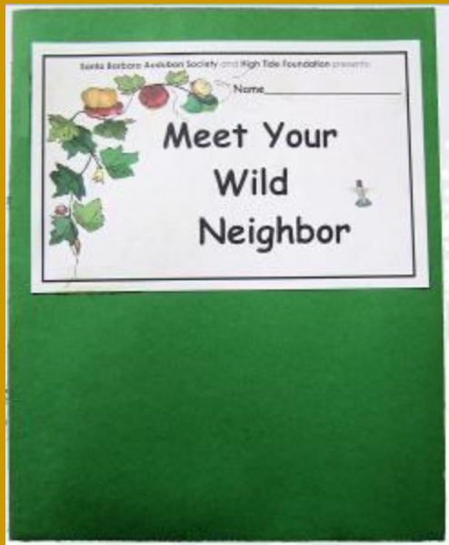
Student Materials Folder