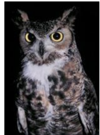
Pictured from left to right: Red-tailed Hawk “Ivan”; American Kestrel “Kachina”; Western Screech Owl “Tecolita” and Great Horned Owl “Max”.