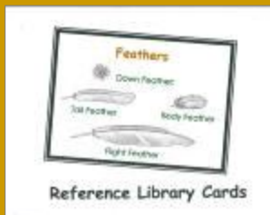
Reference Library Cards